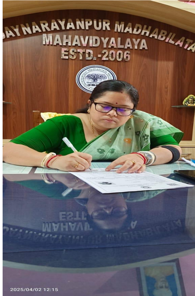
CHARGE HAND OVER BY TEACHER-IN-CHARGE