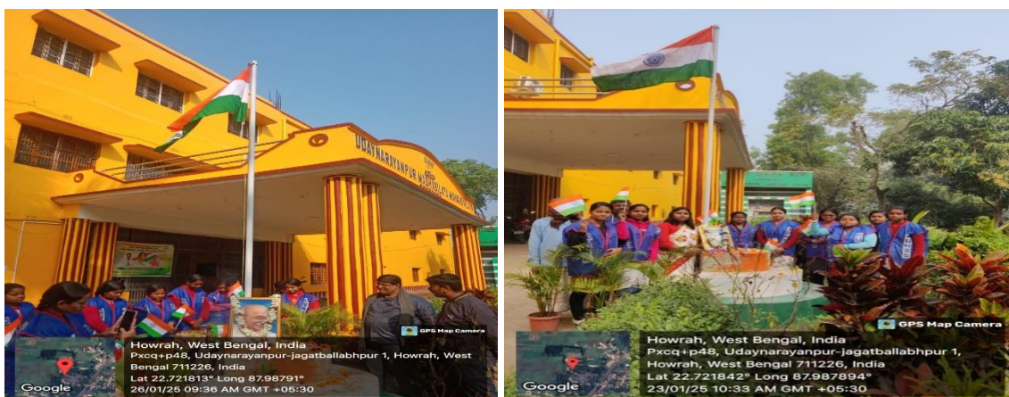
CELEBRATION OF INDEPENDENT DAY