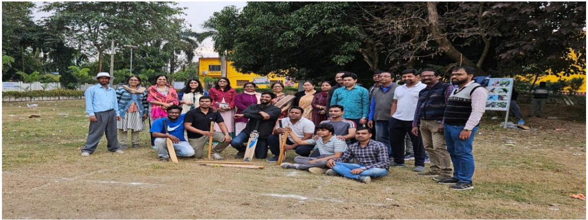
FRIENDLY CRICKET MATCH